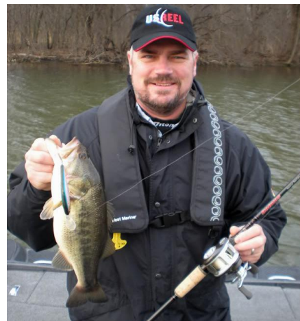
Largemouth taken on a Pointer 100 DD

Each day is different and changing weather conditions might cause the cadence to change throughout a day's fishing. You have to pay attention and the fish will let you know what to do. Once you hook a couple of fish remember what you were doing that generated the strike and replicate it until they stop biting.