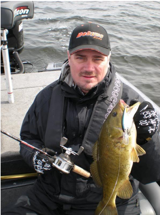
The author with a Smallmouth on a Slim Shad D9

For crankbaits I like a medium diver that runs 7-9 ft (Slim Shad D7 or Slim Shad D-9) and for minnow imitators I use a suspending jerkbait (Pointer 100) or the spoonbill version (Pointer 100 DD) when I need to get a tad deeper in the water column. Both lures have served me well and I usually employ the crankbait first on a steady retrieve using a 6.3.1 reel or a slower 5.4:1 gear ratio. Remember we're scouting super cold water for lethargic bass moving up to put on the feedbag before the pre-spawn calendar period arrives; crankbaits allow an angler to cover a lot of water quickly .