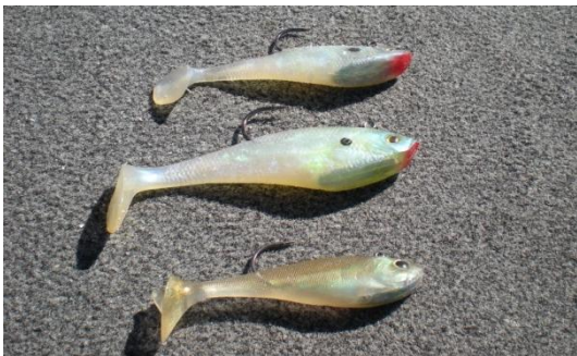
Storm Wild Eye Swimbaits & River2Sea Swim bait

Another effective cold water lure is the swim bait. Cusano recommends the Wild Eye by Storm lures. This is boot tail minnow with an internal lead head that is a great baitfish imitator. He presents this lure on a 7 ft. medium heavy rod with 14 lb. braid and a 10 or 12 lb. fluorocarbon leader matched with a 6.3:1 reel. Often times when the bite slows down on the tube this full body swim bait will get an extra strike or two from the biggest fish in the area. Cusano says a slow steady retrieve seems to trigger the most bites and pay attention to your graph. If you notice