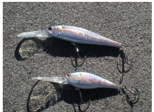
Top: Pointer 100 DD Bottom: Slim Shad D9 Color: American Shad

I've enjoyed most of my ice out success with hard baits, so let's review a few lure choices and techniques that might apply to your local waters. I always try to keep it simple and stick with colors that replicate shad patterns, a dark back, silver sides and a white belly. There are countless lures on the market that fit that description but I use Lucky Craft products. Their color code Aurora Black or American Shad are two of my best producing ice out lures, bar none, and experience tells me our NY bass agree.