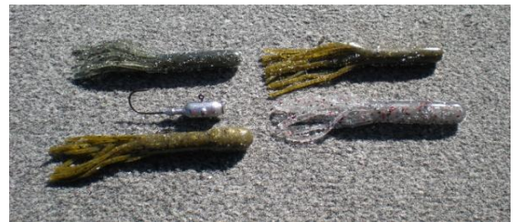
Bass Pro Shops Tender Tubes & ½ oz lead head

To fish faster current requires precise lure control due to the smaller strike zone, where as the fish holding in moderate current are more willing to travel to strike a lure.